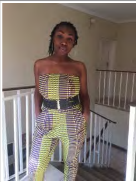
Bilngwe BSc Biology