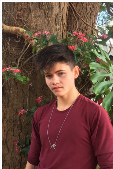
Roarke BA / BS Biological Sciences - Ecology & Evolutionary Biology