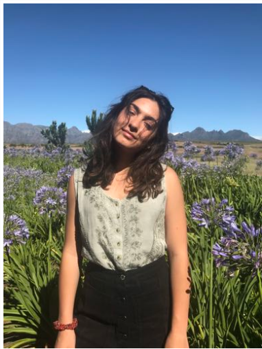
Nir BA Media and Culture